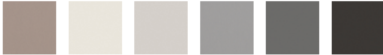
Praline U3062 White Grey U775 Light Grey U112 Lava Grey U3057 Onyx Grey U960 ST9 Cosmos Grey U899 ST9