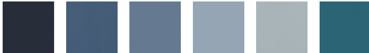
Indigo Blue U599 ST9 Sea Blue U3824 Smoke Blue U507 ST9 Denim Blue U540 ST9 Ice Blue U3271 Petrol U4821