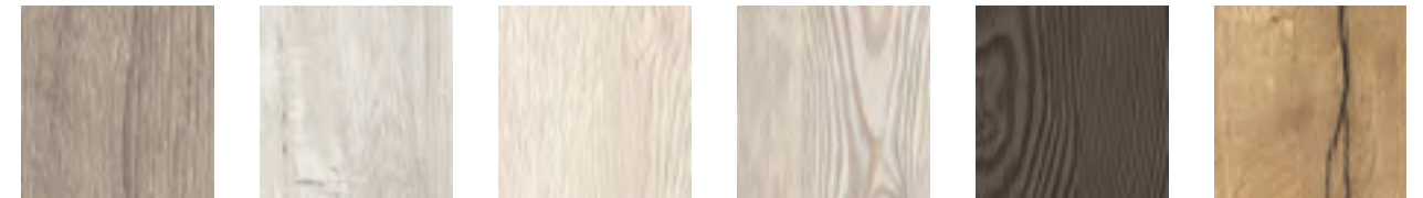
Oslo Oak D3315 SP Cascina Pine H1401 ST22 White Gladstone Oak H3335 ST28 White Mountain Larch H3403 ST38 Anthracite Mountain Larch H3406 ST38 Natural Halifax Oak H1180 ST37