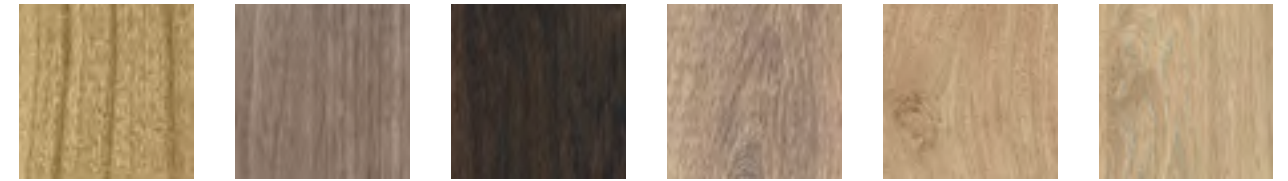
Portofino Cherry D2236 Barcelona Walnut D3813 Tobacco Charleston Oak H3155 ST10 St Peterburgh Oak D3313 SP Natural Kendal Oak H3170 ST12 Natural Davos Oak H3131 ST12