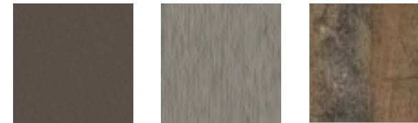
Lava Grey Metallic F447 ST2 Metallic Titanium D853 WF Saturn* D4210 TX

* As matching edging is not available for Saturn, we suggest using black edging.