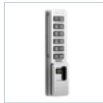
Sola 3 Keyed