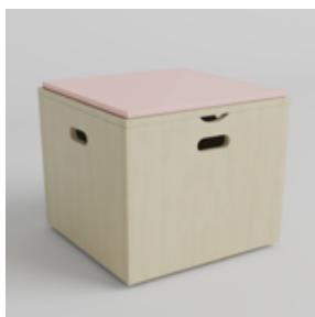
Flip up lid