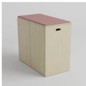
Cupboard at back